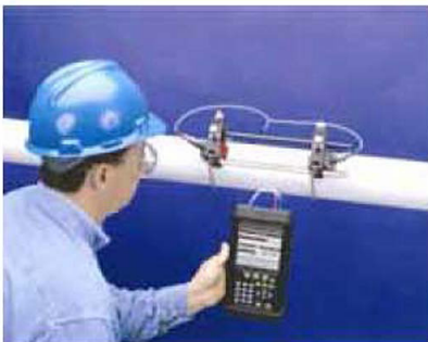
Sample installation of a Panametrics portable ultrasonic flowmeter on a 4" PVC pipe