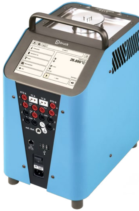
PTC255i Integrated measuring model