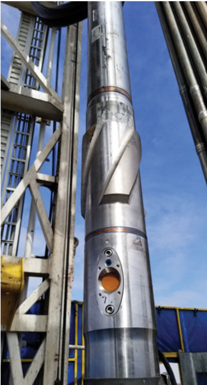
The xSight casing collar and cement integrity (CICM) tool eliminates the HSE concerns and processes necessary for handling radioactive sources.